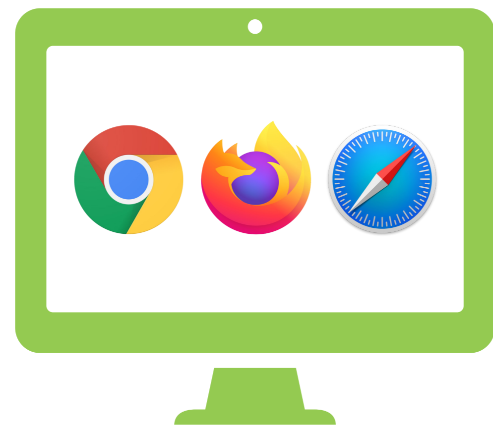
PC and Mac Chrome | Firefox | Safari

1 Use a computer or device with camera/microphone.